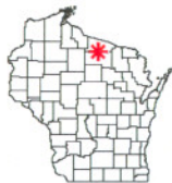
Project Location in Wisconsin

Sources: Roads and Hydro: WDNR Aquatic Plant Survey: Onterra, 2011 Map Date: December 22, 2011 Filename: Map3_LSG_CLP_T2012_Cond1.mxd