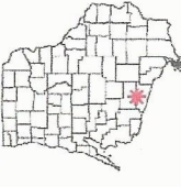
Project Location in Wisconsin

Map Date: May 19, 2016 File Name: LSG_AIS_Final_Pevid.mxd